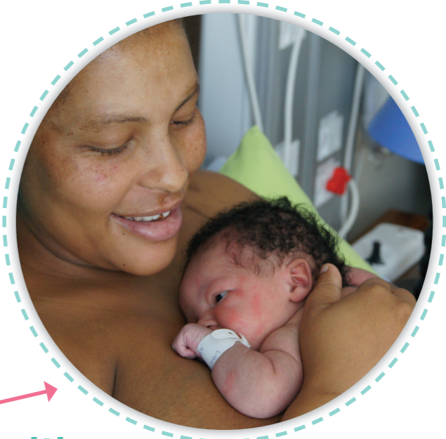
Transition through Birth to skin to skin